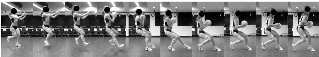
Figure 1: Sagittal view of sport-specific leap landing task.

METHODS: Twenty-five female netball players ( 23.5 \pm 3.0 yr; 171.0 \pm 7.9 cm; 67.6 \pm 9.0 kg), free of current injury and no history of ACL injury participated in this study. The sport-specific landing examined was a netball leap landing; which involved a six-metre run-up, followed by a single limb take-off and land on the contralateral limb while catching a pass (see Figure 1). Participants completed 20 successful trials, with 60-90 seconds rest allocated between trials.