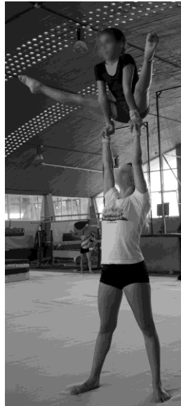
Figure 1: Straddle lever pyramid.

straddle position. During the performance of the pyramids, the base gymnast stood with one foot on each platform to facilitate recording of the variations in the centre of pressure at a frequency of 200 Hz. Five successful trials were recorded for each pair, with at least 2-3 minutes rest allowed between trials.