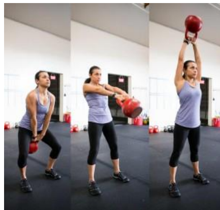
Figure 2. The “American Style” (Swing-Dominant) Swing, characterized by the swing reaching above the eye level to above the head (Crossfit Station, 2014).

METHODS: Nine college aged, right leg dominant, women (mean \pm SD: age = 21.4 \pm 1.8 years; height = 164.3 \pm 5.9 cm; and weight of 67.4 \pm 9.6 kg) participated in the current study. Participants signed an informed consent form and completed a Physical Activity Readiness-Questionnaire prior to participating in the study. Approval by the Institutional Review Board was obtained (HS14-620) prior to commencing the study.