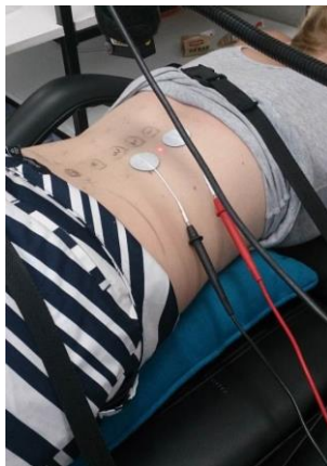
Figure 1- Experimental setup for stimulation MMG protocol. A pair of TENS surface electrodes deliver a brief PNS to maximally stimulate the local muscle tissues surrounding a LZJ. A laser, positioned between the two surface electrodes, records the lateral swelling of the local muscle tissues following the PNS. The resultant MMG waveform allowed characterisation of the contractile properties of local muscle tissues surrounding the 10 LZJ and the left and right multifidus over the sacrum.

Analysis of data was conducted using a two-way ANOVA, with two factors- segment (L1 to M2) and side (left to right), with significance accepted at p \leq 0.05 . If significance was reached, a pair-wise multiple comparison procedure (Tukey Post-Hoc) would be performed to determine which segments attributed to the significant result. All statistical analysis was conducted in GraphPad Prism™ 6.