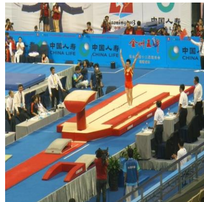
Figure2: Game site photo

RESULTS AND DISCUSSION: In order to facilitate the analysis of the data, we divided the whole movement into four stages.