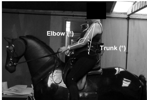
Figure 1: Lab set-up and angle conventions

Following the breast mastectomy (122 days later), the participant returned for a repeat lab session. No breast reconstruction had occurred for the