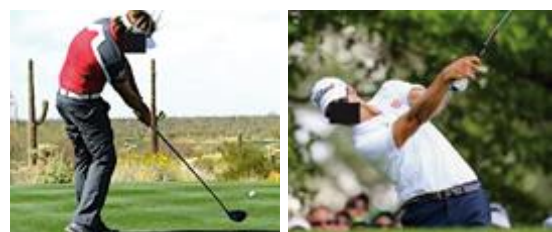
Figure 6: crunch factor at impact (right) and during follow through (left)

CONCLUSION: Physiopathology of golf related back pain is pluri-factorial. Beside the general factors (aging, bad muscular control, overweight, etc.), there are specific golf factors that can be analyzed with biomechanics tools. Prevention for average player as for elite player needs technical corrections in order to eliminate technical faults. These corrections arise from biomechanics data and coaches must be trained in order to use them properly.