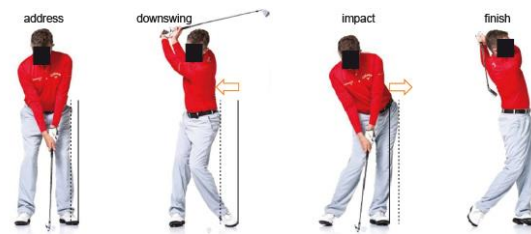
Figure 4: left to right slide from the downswing position