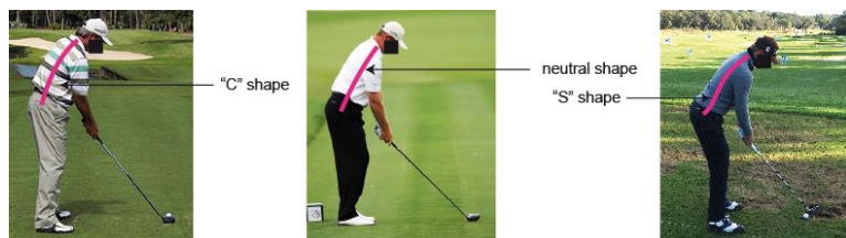
Figure 1: position at address

An exaggerated position will pre-stress the spine and specific anatomic structures: "S" shape will pre-stress the facet joints and "C" shape the intervertebral discs. We know