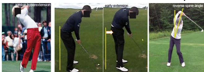
Figure 5: lumbar hyperextension, early extension, reverse spine factor characteristics