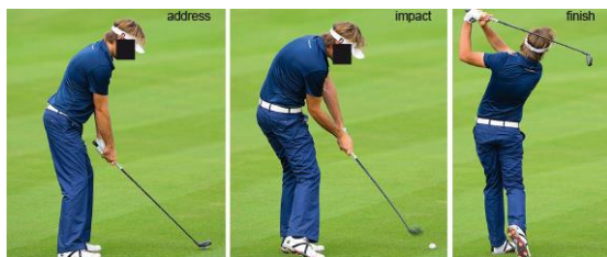
Figure 3: pelvic tilt during the swing