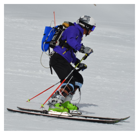
Figure 1: Instrumented skier with dynamometers, goniometer, DGPS and inertia sensors.

INTRODUCTION: There is an increasing number of total hip replacements in OECD countries, Pabinger & Geissler (2014) account for 200-280 per 100.000 population in USA, Switzerland and Germany. The majority of patients regain full mobility and formerly active people like to go back into sports. For the reason of rehabilitation intending to increase the persons' muscular protection capacity and to support the healing process, even formerly inactive people should be motivated to sport activities. In the consequence after total hip replacements, orthopaedic surgeons often have to answer the question which sport they would recommend and if skiing belongs to the recommendable ones. Skiing may create rather high loads acting on the leg, not only due to centripedal forces but also because of excitations of vibrations from the slope. Sometimes there might be even impacts in case of falls or collisions. As this could result in significant loading of the hip joint compared to daily activities, our case study intends to quantify the hip joint reaction forces – looking at first at different type of skiing manoeuvers.