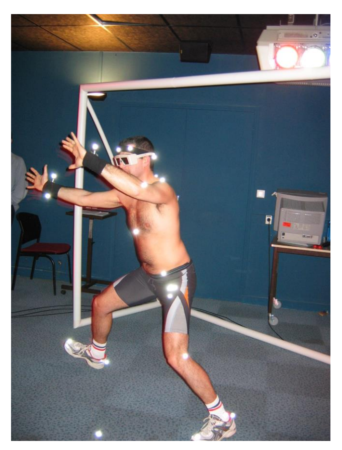
Figure 1: handball goalkeeper trying to intercept virtual ball thrown by a simulated opponent in order to study the perception-action coupling in this simulated situation.

Using virtual reality therefore allows us to overcome these limitations by providing an environment with standardized throws and a real time interaction between the handball goalkeeper and the ball trajectory, as shown in Figure 1. We have shown that large scale immersive systems (named CAVEs) with simulated throws performed by virtual opponents could lead to natural behavior of the goalkeeper. We also have shown that performance of goalkeepers in such an immersive environment was more similar to real performance than when using video, as generally performed in previous works (Vignais et al., 2015).